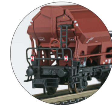
The side dump car has marker discs